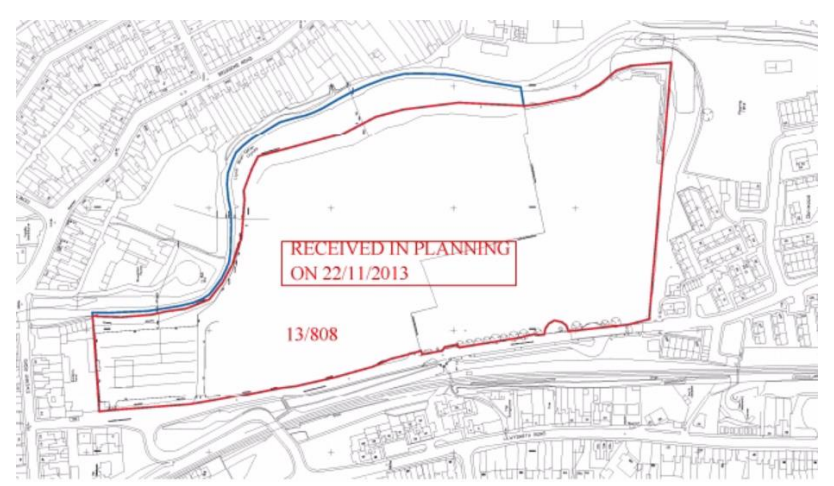
Fig. 1 - Site Location Plan

The development area comprised 4.9 hectares within the freehold ownership of PCMC and 2.75 hectares within the freehold ownership of Bridgend County Borough Council (BCBC).