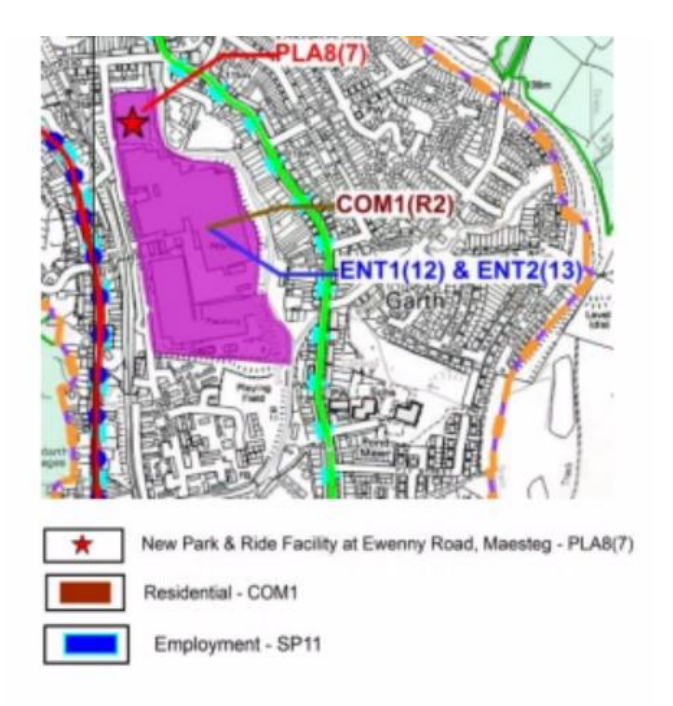
Fig. 8 – Extract from Replacement LDP Proposals Map