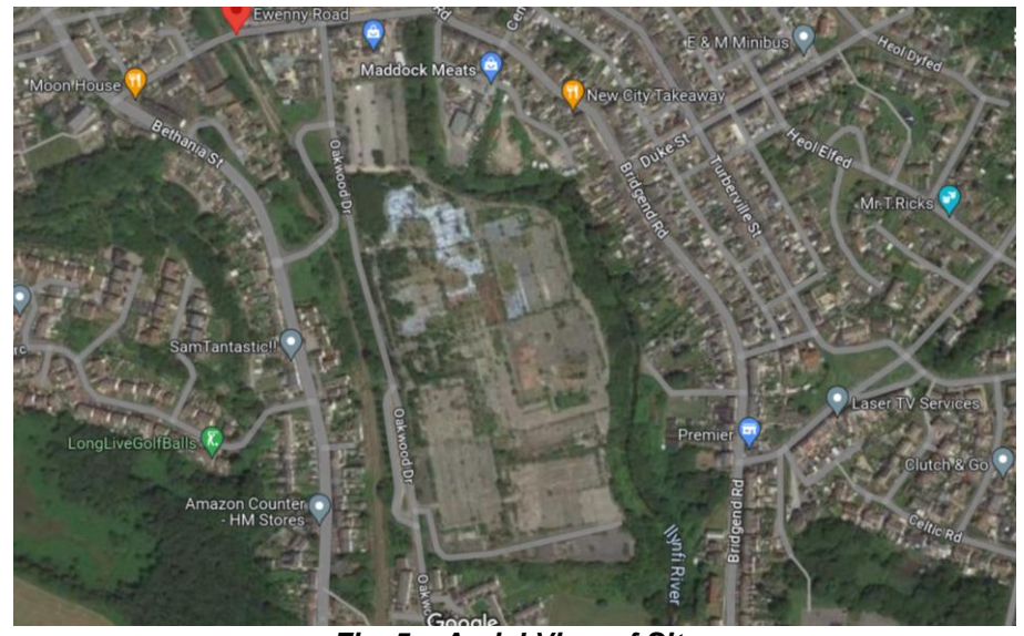
Fig. 5 – Aerial View of Site

Given the significance of redeveloping this brownfield/previously developed site, a development strategy has been progressed. Robust technical studies have been prepared that consider the level of flood risk at the site, the consequences of flooding and mitigation measures to address those risks and consequences. The phasing of the development has been considered with regard to the site enabling and flood works which will be required to be undertaken as part of the CCR funding process.